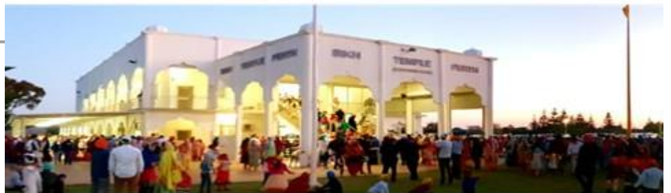
Diwali celebrations at Gurdwara Sahib pre COVID

Please enter your details into the Visitor's Register